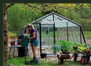
From the kitchen garden

Fresh seasonal vegetables by Henja's hand.