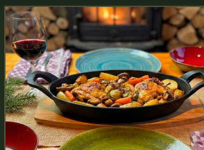
Slow-cooked chicken with a 'bite'

Booking is required and arranged in good time — a week before your arrival you'll receive the seasonal menu in your inbox, and you simply choose what you'd like. We take care of the rest.