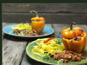
Pasta, Pepper & Passion