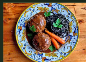
Vegetarian Liège meatballs

For two. Straight from the oven to the table.